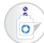
PACKAGING & LABELLING