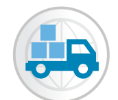
STORAGE & DISTRIBUTION