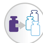
SCALE-UP TO COMMERCIAL PACKAGING