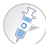
PFS ASSEMBLY & LABELLING