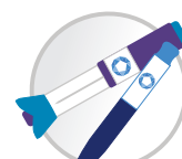
AUTO-INJECTORS & PENS