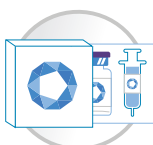
CARTONING, KITTING & REWORK