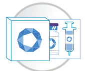
CARTONING, KITTING & REWORK